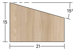
Glazing bead For unrebated screen frames.