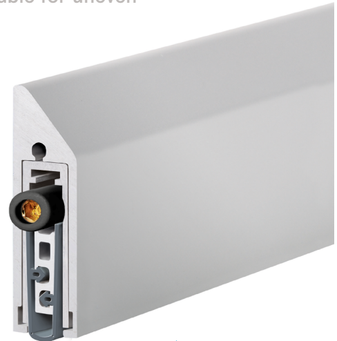
Planet KG-S Narrow