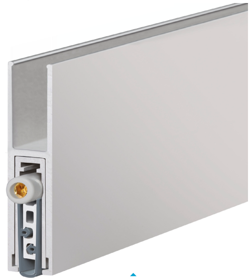
Planet KG-F8 Narrow