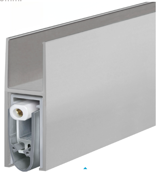
Planet KG-F12s Narrow