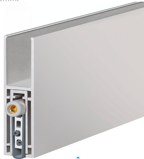
Planet KG-F10 Narrow