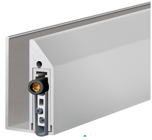
Planet KG-A8 Narrow