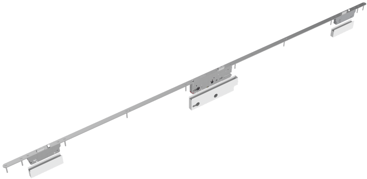
▲ Lock + latch protection kit