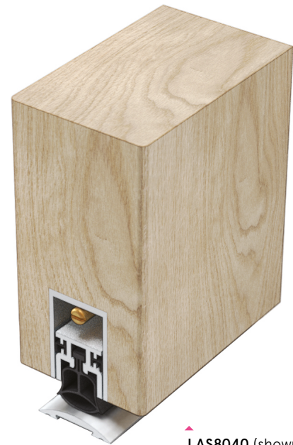
↑ LAS8040 (shown with LAS4001)