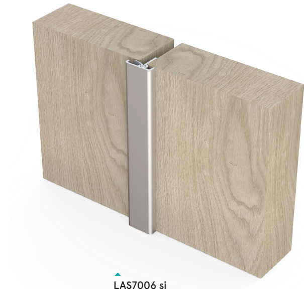
▲ LAS7006 si