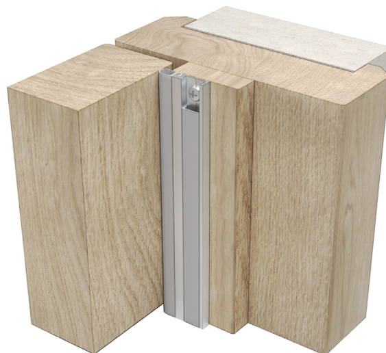
▲ LAS7002 si