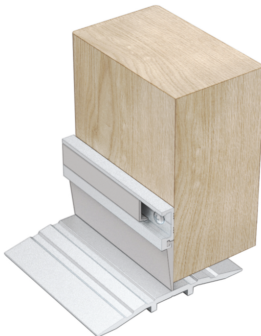
LAS3004 si (shown with LAS4010)