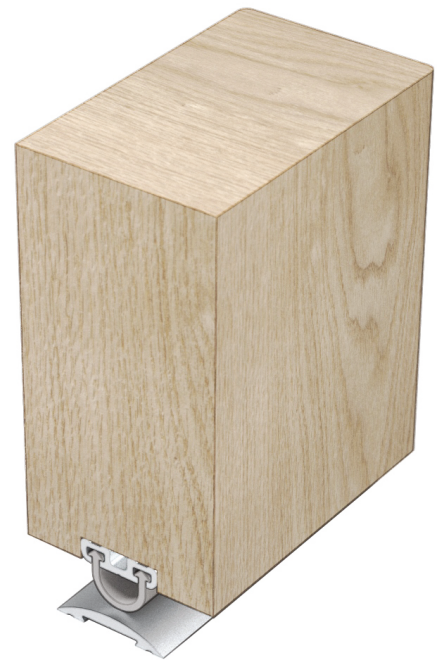
▲ LAS3001 si (shown with LAS4001)