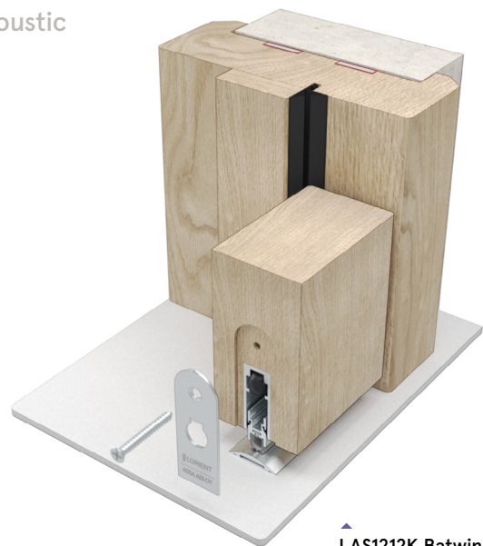
LAS1212K Batwing ®